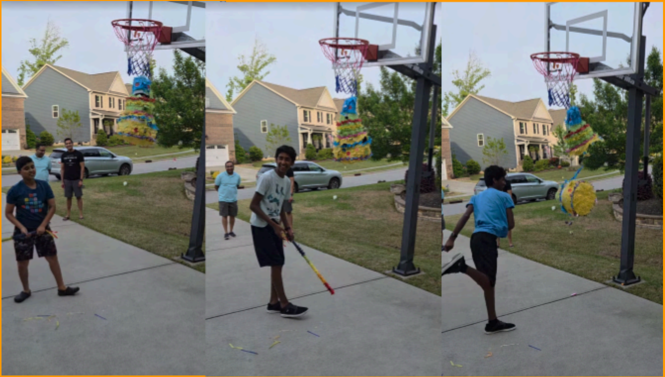
Sunday School – Easter Egg Hunt