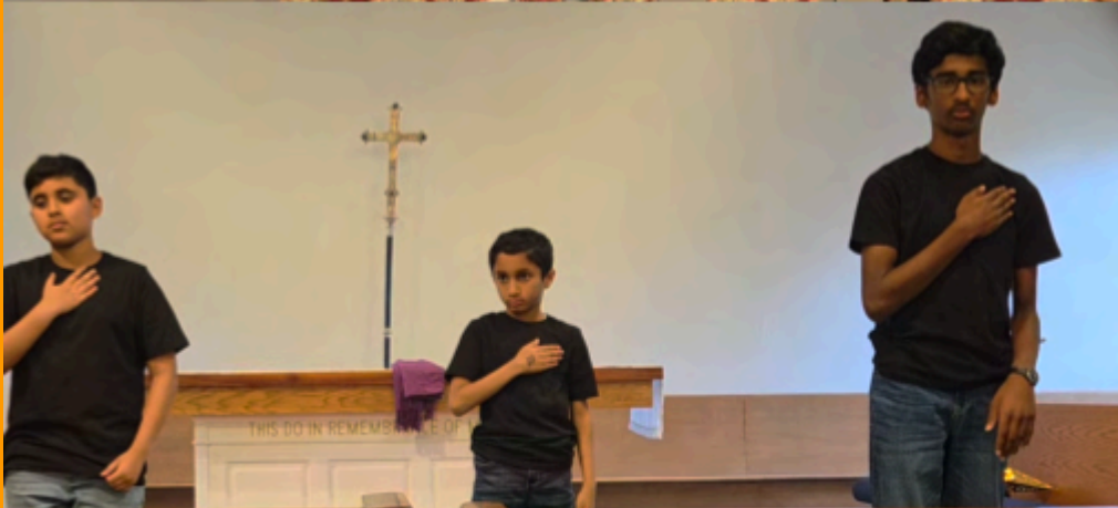
Sunday School - Easter 2025