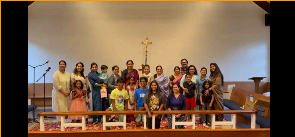
Mother's Day 2025